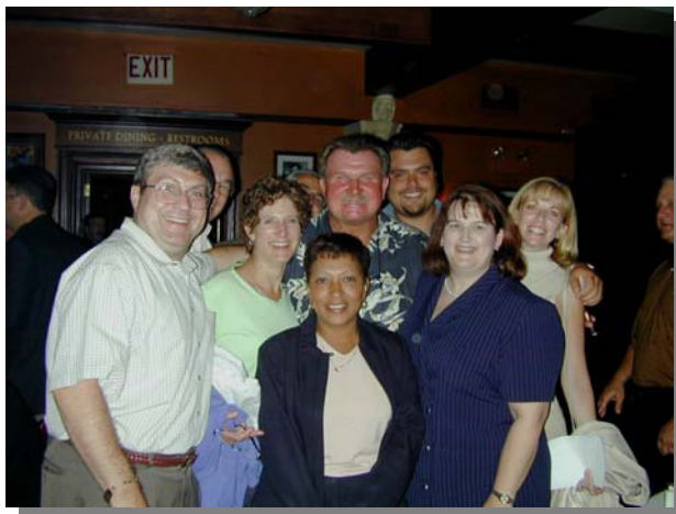
NAVUBPP Members relaxing with Mike Ditka after COE meetings September 2001.