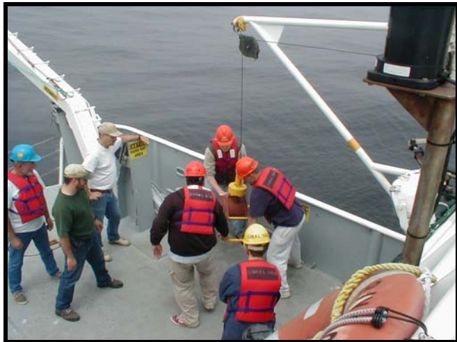
Oceanography students sampling the ocean floor with the Shipec grab sampler