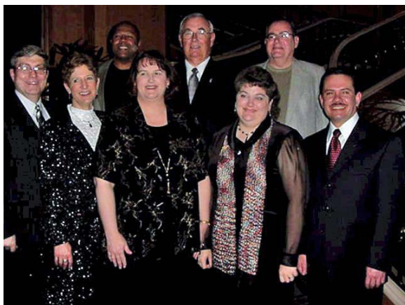
(NAVUBPP Executive Board)

Funding for these programs was restored to the FY 2006 budget. However, in late December, 2005, a 1% across-the-board decrease was imposed on federal discretionary spending, costing the level-funded TRIO programs, a cut of 1%. That will mean an overall loss of $8.3million from the current $836.5 million budget. COE does not anticipate that any existing grants will be cut.