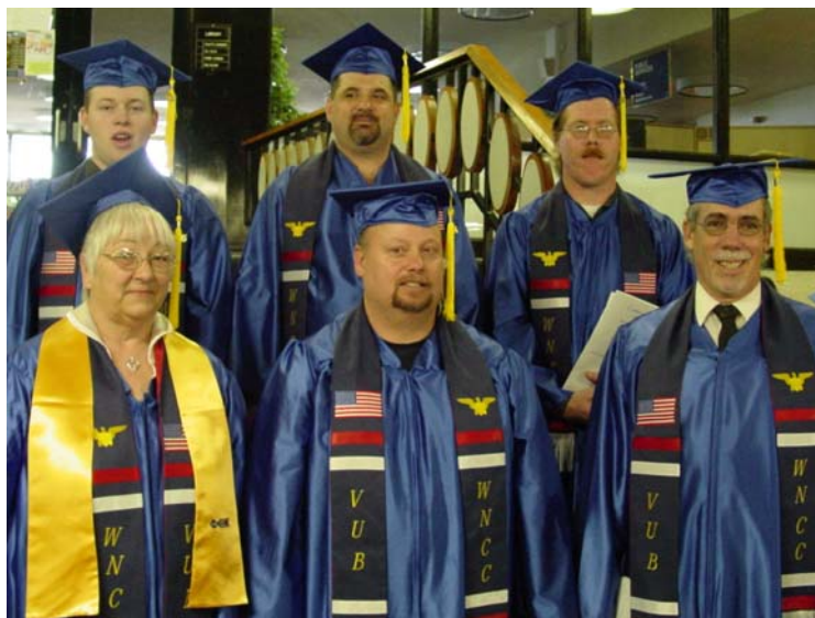
(Graduates from Veterans Upward Bound, May 14, 2005, Western Nebraska Community College.)